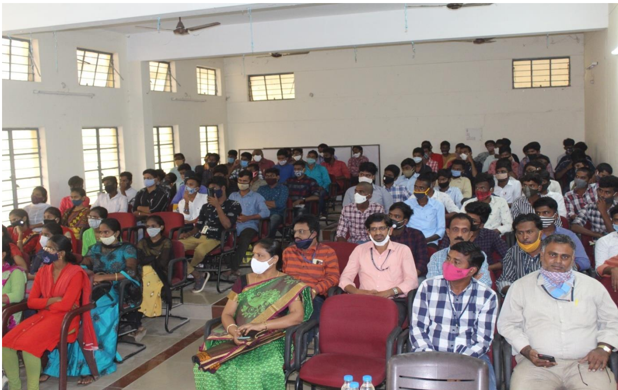
Faculty and Students attended the programme