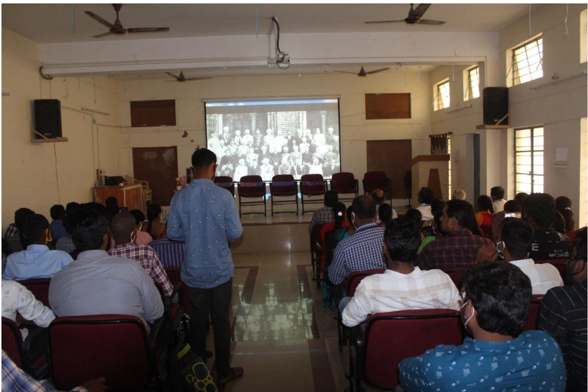
Playing Inspirational videos