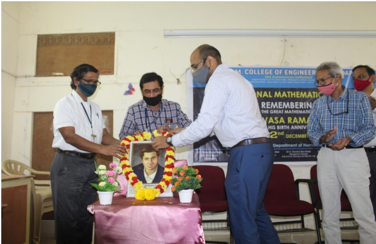
Garlanding the portrait